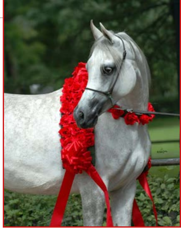
GALILEA - 2000, Laheeb x Georgia

In 2002, Gaskonia won the Senior Mares Class at the National Show in Janów Podlaski. At the same show, her son Grafik by Eucalyptus, born in 1996, firstly won the 4-8 year old Stallions