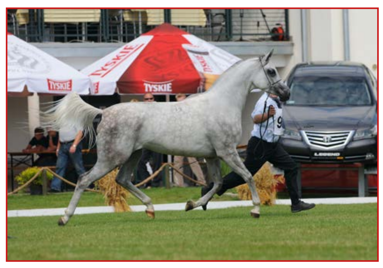
EMIRIONA - 2005, Grafik x Emmona

four "20". Grafik also won his 9-year-old and older Stallions Class with a total of 92.00 points. In the championship, the stallions also decided to divide the titles among themselves: Gaspar won the title of the Senior Champion Stallion, and Grafik became the Reserve Champion. At the auction, however, Georgia's full sister, Gehenna, turned out to be the most expensive horse as her bidding stopped at €180k.