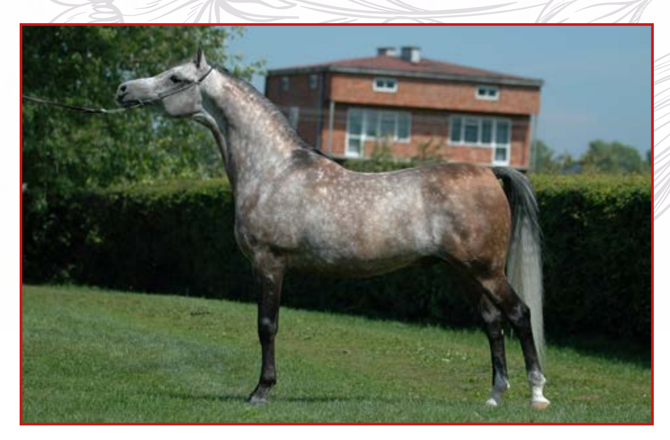
GASPAR - 1991, Ararat x Emigrantka

Class, and then won the title of the Reserve Champion Stallion of Poland. Galilea, Georgia's daughter, came second in the 2-year-old Fillies Class, and the aforementioned Probat's daughter - Eskalopka obtained the score of 94.67 points, which then translated into the title of the Senior Reserve Champion.