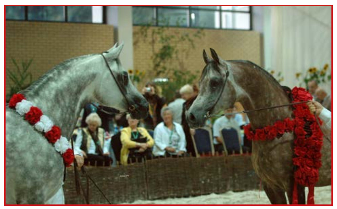
GRAFIK and GASPAR